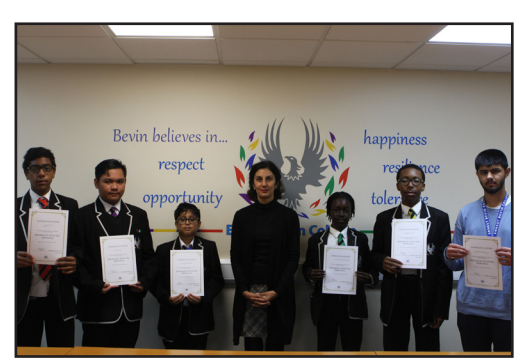
Achievements in College