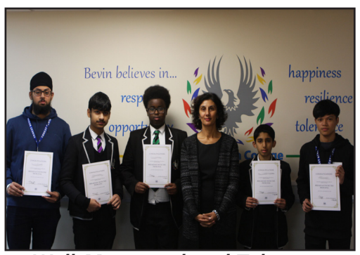
Well-Mannered and Tolerant